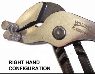
RIGHT HAND CONFIGURATION

Thank you for purchasing our Wulf's Custom Welding G.E. Exhaust Manifold Clamp Pliers. They may also be used as a pair of conventional pliers. Follow all of the safety instructions and procedures stipulated by your employer for the use of hand tools and equipment when using these pliers.